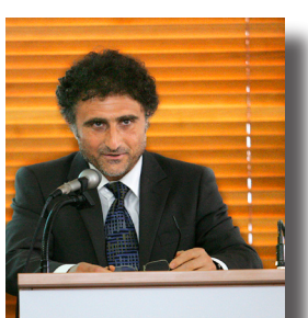
Australian Institute of International Affair

This project, which reviews the negotiating process of the Cyprus conflict over the last forty years, comes at a critical time for the partitioned islandstate of Cyprus and for the most recent attempts